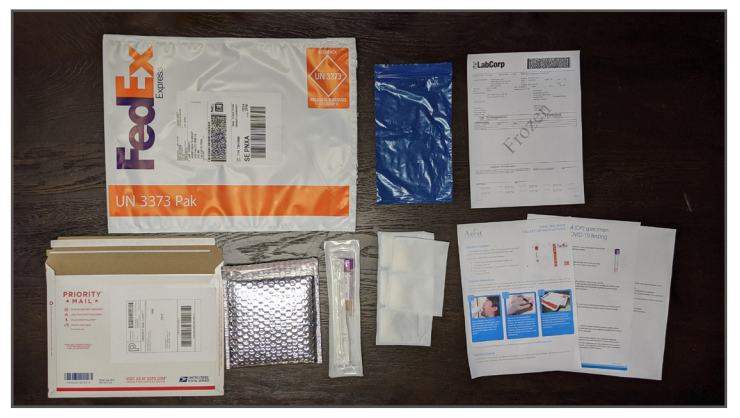
Assist Health Group's at-home COVID-19 screening kit

Using our knowledge of at-home colorectal cancer screening testing, we developed our own solution, with the help of our collaborating labs, to screen individuals for COVID-19 from the comfort of their own homes. In a time where leaving home became risky, the need for at-home options for care was at an all-time high.