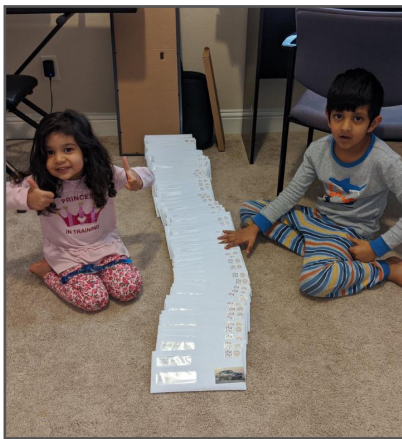
Having fun while working from home!