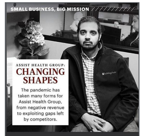
Assist Health Group in the Dallas Business Journal

Having overcome the various barriers faced along the way, the team returned back to office in May, happy to see each other. Later in the month, the Dallas Business Journal covered the Assist Health Group with a story on our experience surviving the pandemic. We continue to work around the daily curveballs the pandemic throws at us and look forward to serving our patients and our providers.