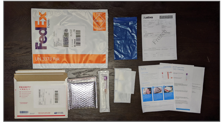
Assist Health Group's at-home COVID-19 screening kit

Once the Food and Drug Administration announced that COVID-19 screening tests administered by a medical professional were the preferred method of screening, we decided to discontinue the offering and paused our efforts to gather more swabs. We hope to revisit the ability to send tests out in the future to ensure accessible testing nationwide, but have no current timeline.